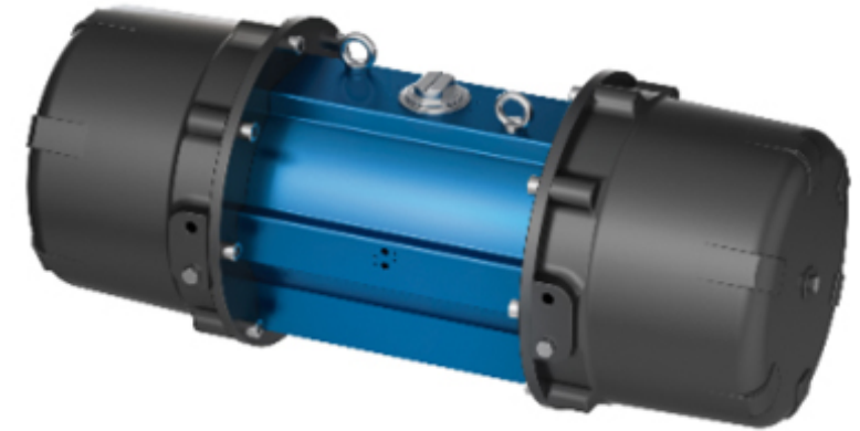
SADT / SADP