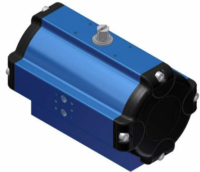
SAD - 135°